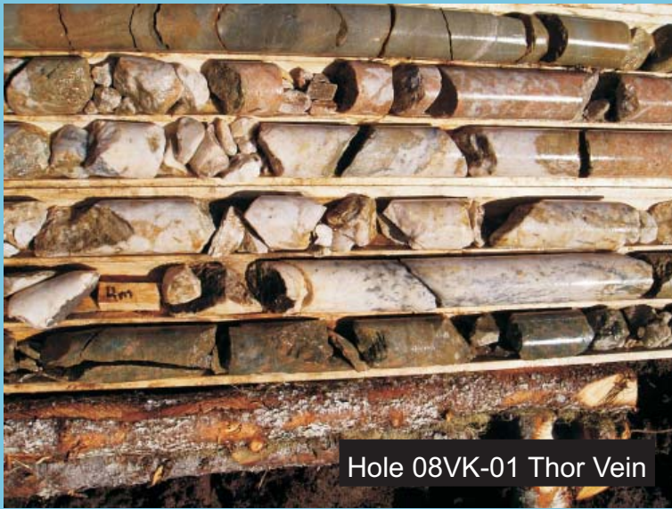
Hole 08VK-01 Thor Vein