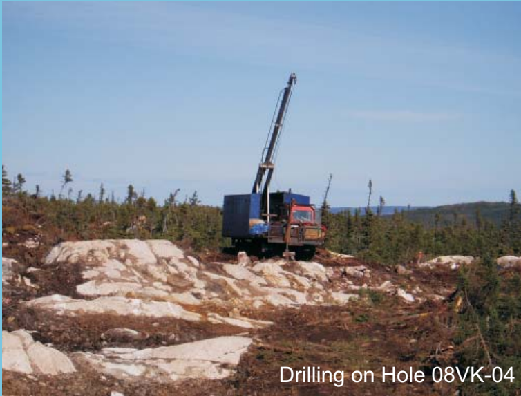
Drilling on Hole 08VK-04