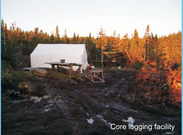
Core logging facility