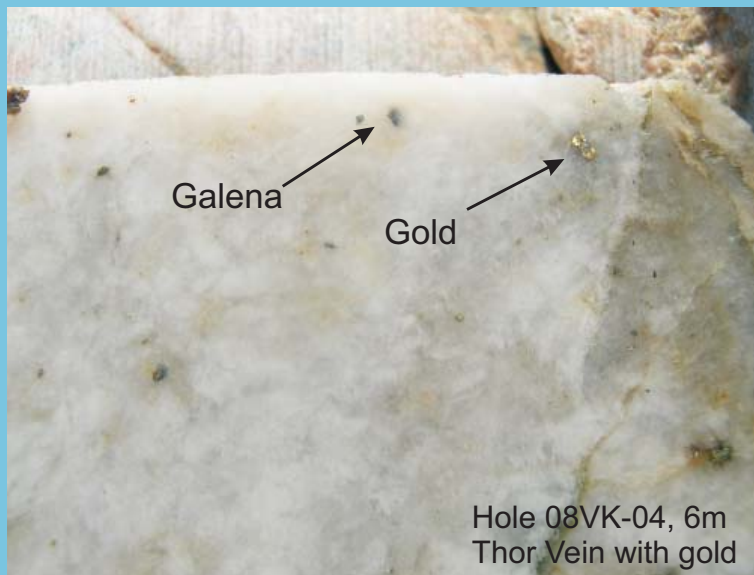
Hole 08VK-04, 6m Thor Vein with gold