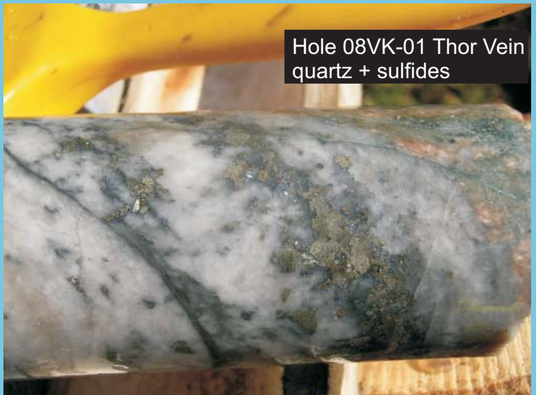
Hole 08VK-01 Thor Vein quartz + sulfides